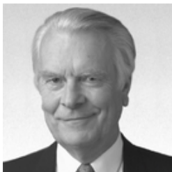
The Rt. Hon. Lord Owen CH FRCP